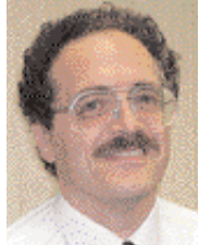
by Mark Gebbia, Illinois Capacitor, Inc.

With the rapidly changing landscape in ICs and other semiconductors, it is easy to think of the supporting cast of electrolytic capacitors as a design constant. While many electrolytics look similar to their counterparts of a few years ago, capacitor technology has continued to evolve. Today's electrolytics are more reliable, offer higher capacitance densities and more mounting options. One of the parameters that has recently come under closer scrutiny by designers is ESR, or equivalent series resistance . Stated in ohms and referenced to specific frequencies, ESR is easier to define than it is to specify.