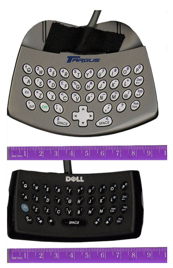
Figure 2. The modified Targus (top) and Dell (bottom) keyboards.

The study occurred in our usability lab with each of the two keyboards connected to a separate Pentium III workstation. We employed the Twidor software package (used in the series of studies on the Twiddler chording keyboard [2, 3]) and adapted it to accept data from our modified keyboards. The Twidor software was configured to use the MacKenzie and Soukoreff phrase set [7], a set of 500 phrases representative of the English language. The phrases range from 16 to 43 characters with an average length of 28 characters. The phrase set was modified to use only American English spellings and display only lower case letters and spaces (no punctuation or capitalization). Each test phrase was shown on the screen and remained there while the subject typed.