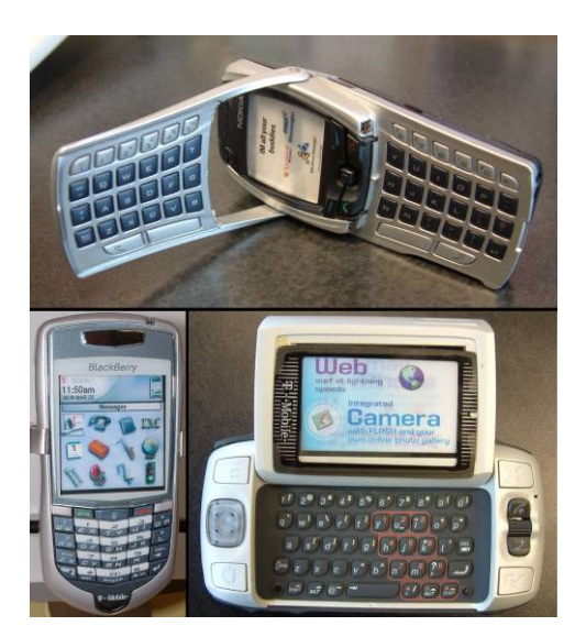
Figure 1. Nokia 6820 (top), RIM Blackbery (bottom left) and Danger/T-Mobile Sidekick (bottom right).